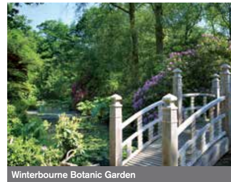
Winterbourne Botanic Garden