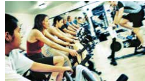
The Munrow Sports Centre