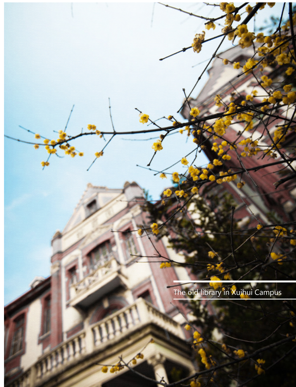
The old library in Xuihui Campus

* For more detailed information about Chinese Language course: www.sie.sjtu.edu.cn