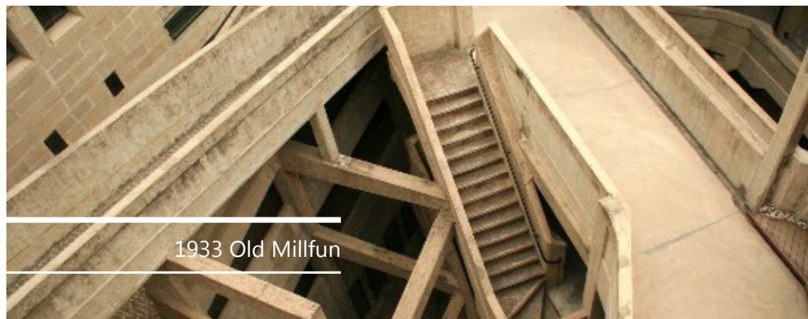
1933 Old Millfun

There are popular spots here. The Umbrella Column, Gallery Bridge, French Stair and some other spots are most unique and attracting.