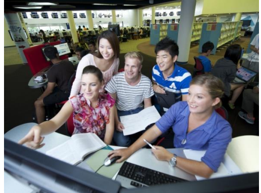
Meeting of great minds from all over the world

We understand that choosing the right university to meet your study abroad needs, hopes and expectations can be a considerable challenge, albeit an exciting one. Catering to more than 1800 exchange students from over 30 countries and 265 institutions in AY2016-2017, we are proud to introduce NTU as your first choice for an Asian study abroad experience.