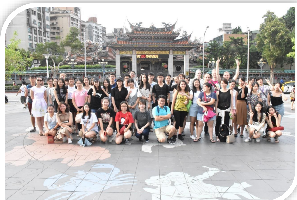
Longshan Temple Visit