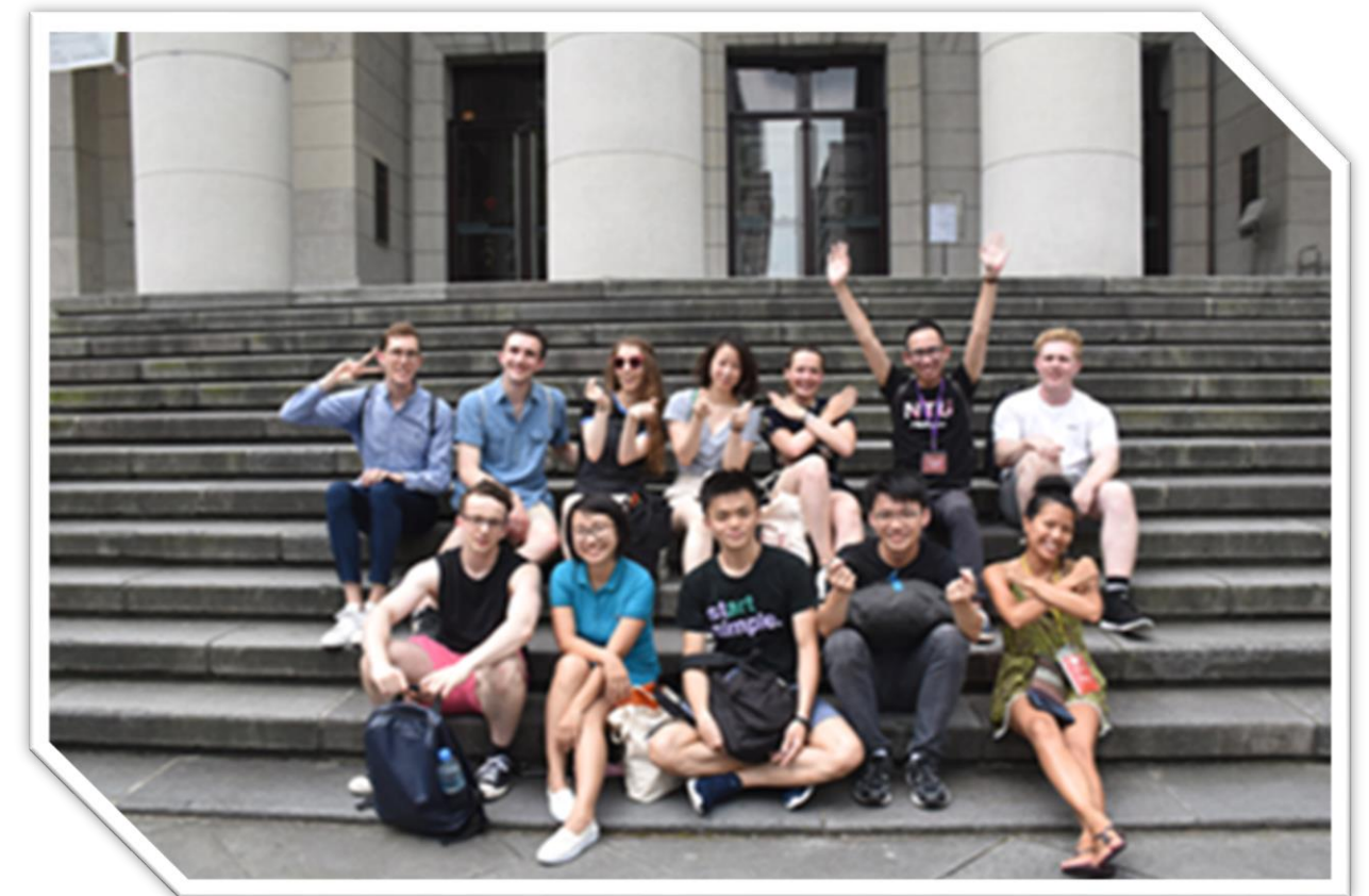
2017 +C2 Chinese Translation & Culture program students from University of Oxford, Australian National University, KU Leuven, Leiden University, The University of Queensland, University of London, University of Houston, University of the Philippines, and Yale-NUS College (at National Taiwan Museum)

Each program offers a number of well-trained NTU students who can provide support for any problem you may encounter during your summer program.