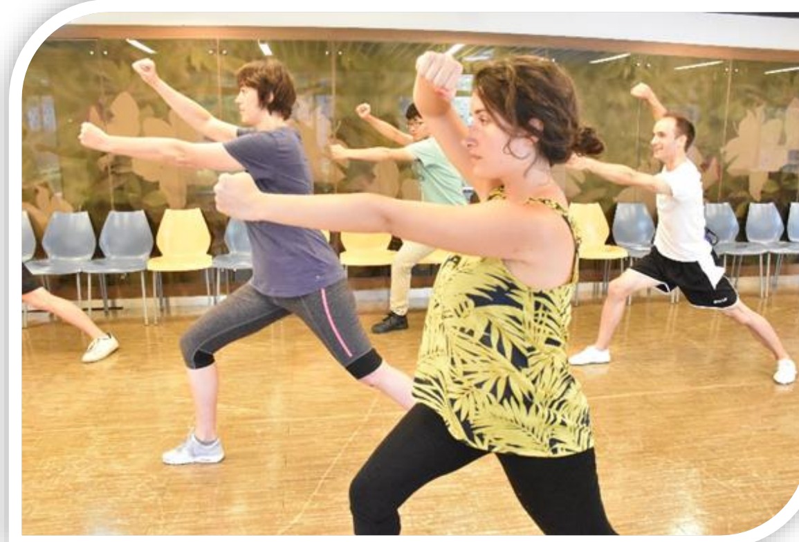
Martial Art Activity