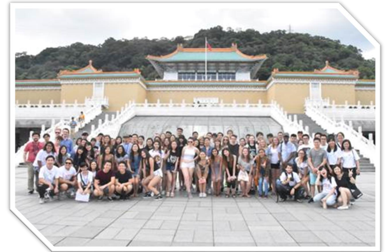
2017 Summer+ program students from all over the world (at National Palace Museum)

Each program offers a number of well-trained NTU students who can provide support for any problem you may encounter during your summer program.