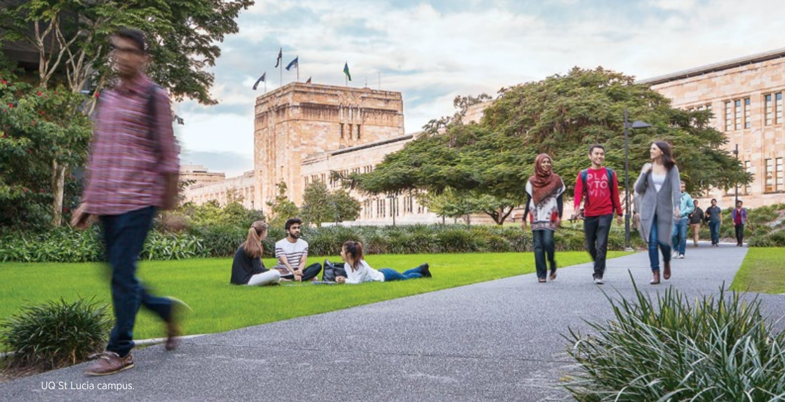
UQ St Lucia campus.