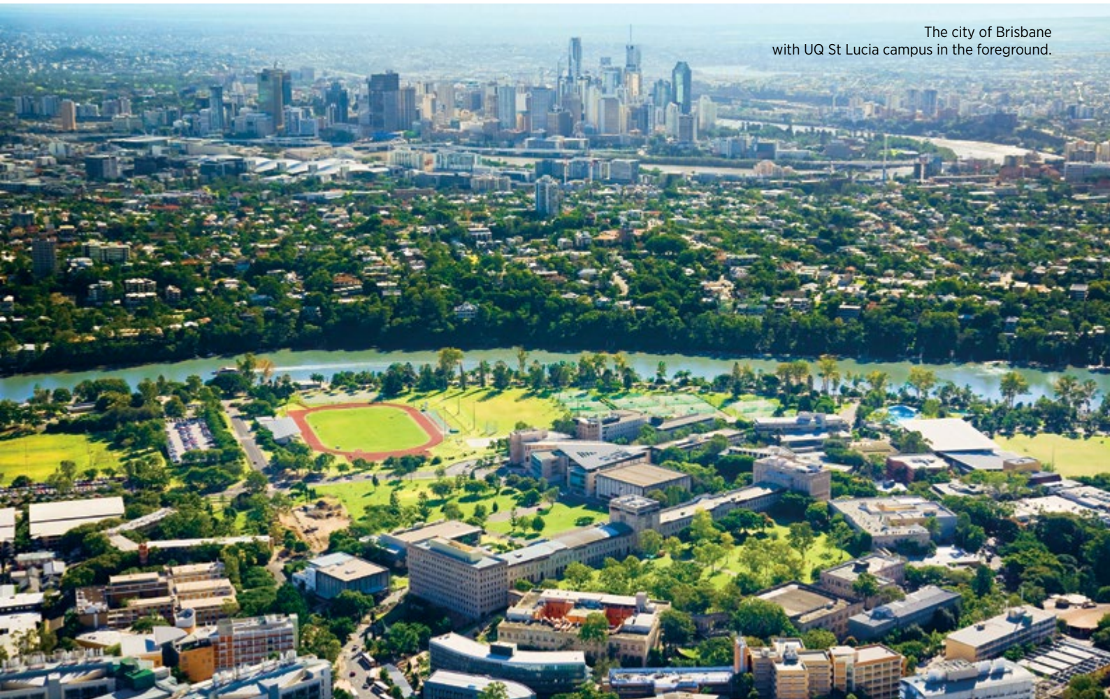
The city of Brisbane with UQ St Lucia campus in the foreground.