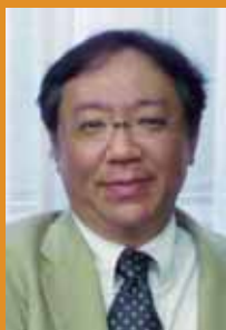
Professor Contemporary Management